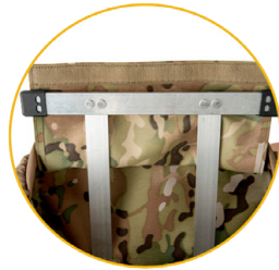
Hidden Aluminum Frame