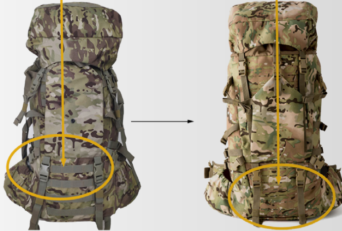
Tradition ILBE Webbing Version