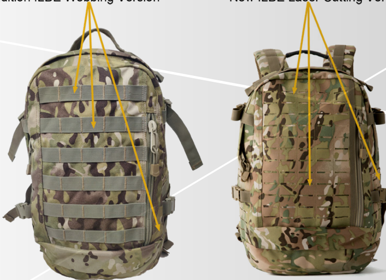
New ILBE Laser Cutting Version